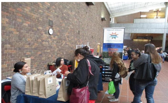
Pictures from the Lakota Invitational Tournament Booth in Rapid City on December 19 and 20, 2019. Staff talked to 500+ people each day about SHS results and ancillary studies.