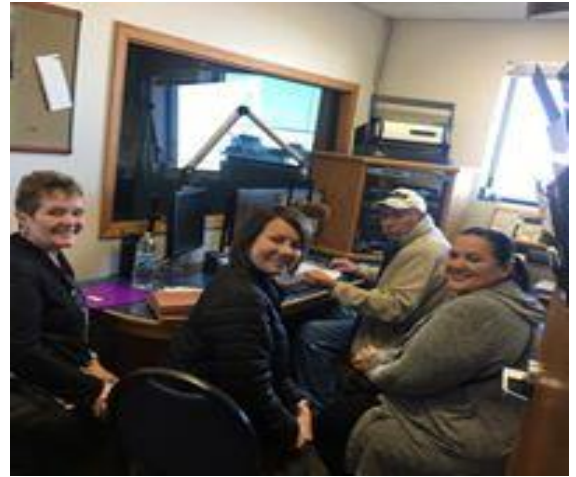
Spirit Lake Radio, KABU 90.7.